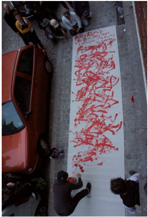
Yves Grenet, LA FABRIQUE D'ÉMOTIONS SADAHARU HORIO + On-Site Art Squad «KUKI»