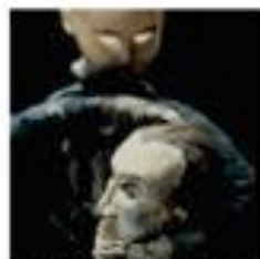
The Quay Brothers' Universum nu bij EYE, t/m 9 maart

Share Facebook Twitter Delicious StumbleUpon