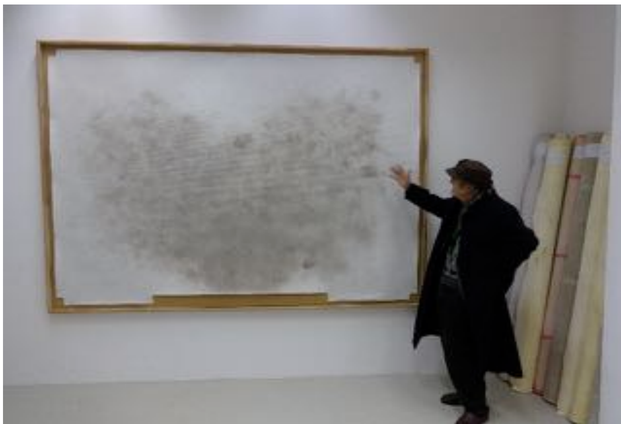
Artists Club, MARCHANDS DE TAPIS, Brussels Cologne Contemporaries 2013